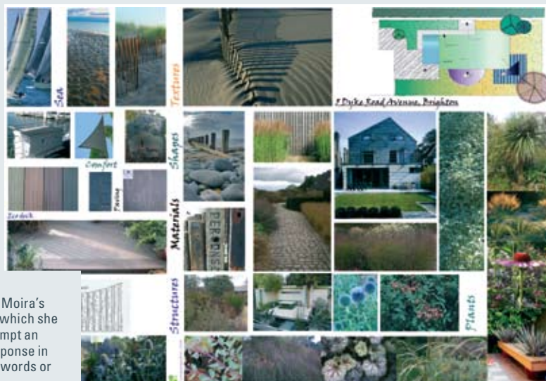
RIGHT One of Moira's moodboards, which she feels can "prompt an emotional response in a way that no words or plan can".